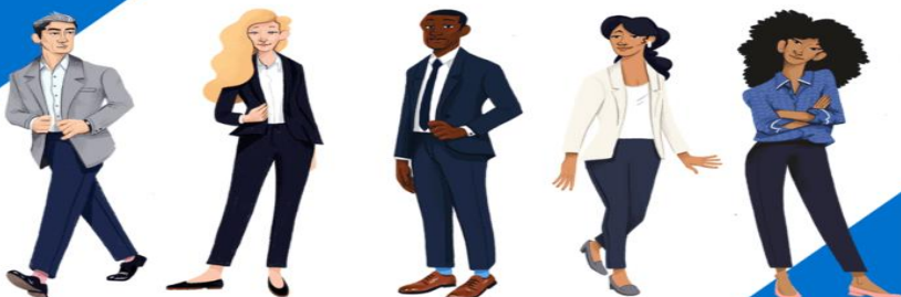
THINGS YOU SHOULD NOT WEAR TO A JOB INTERVIEW

Choose clothes you're COMFORTABLE and CONFIDENT in!!